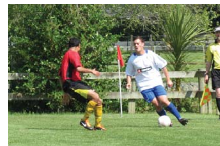
More action from last year's match.