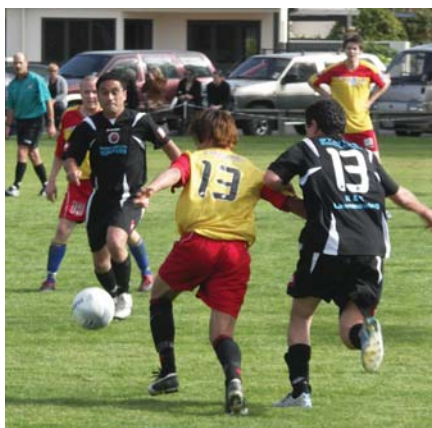
Action from the first All Star game ever held, played at Matamata in 2007.