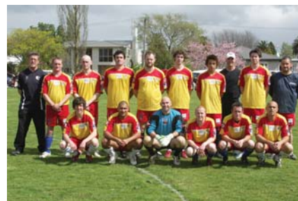
The South Selection