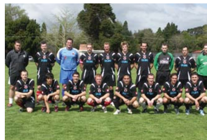
The North Selection